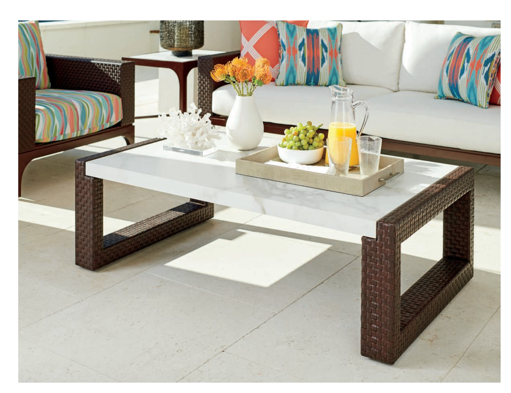
3420-947 Abaco Rectangular Cocktail Table 52W x 30D x 17H in.

Featured on the opposite page are the Abaco 88-inch sofa and 62-inch love seat. Accent pillows on both frames are optional, allowing for unlimited customization as shown below. The 52-inch rectangular cocktail table is one of our favorite designs because of the way it blends woven wicker with a thick sintered stone top. The contrast of materials and colors makes for a striking presentation.