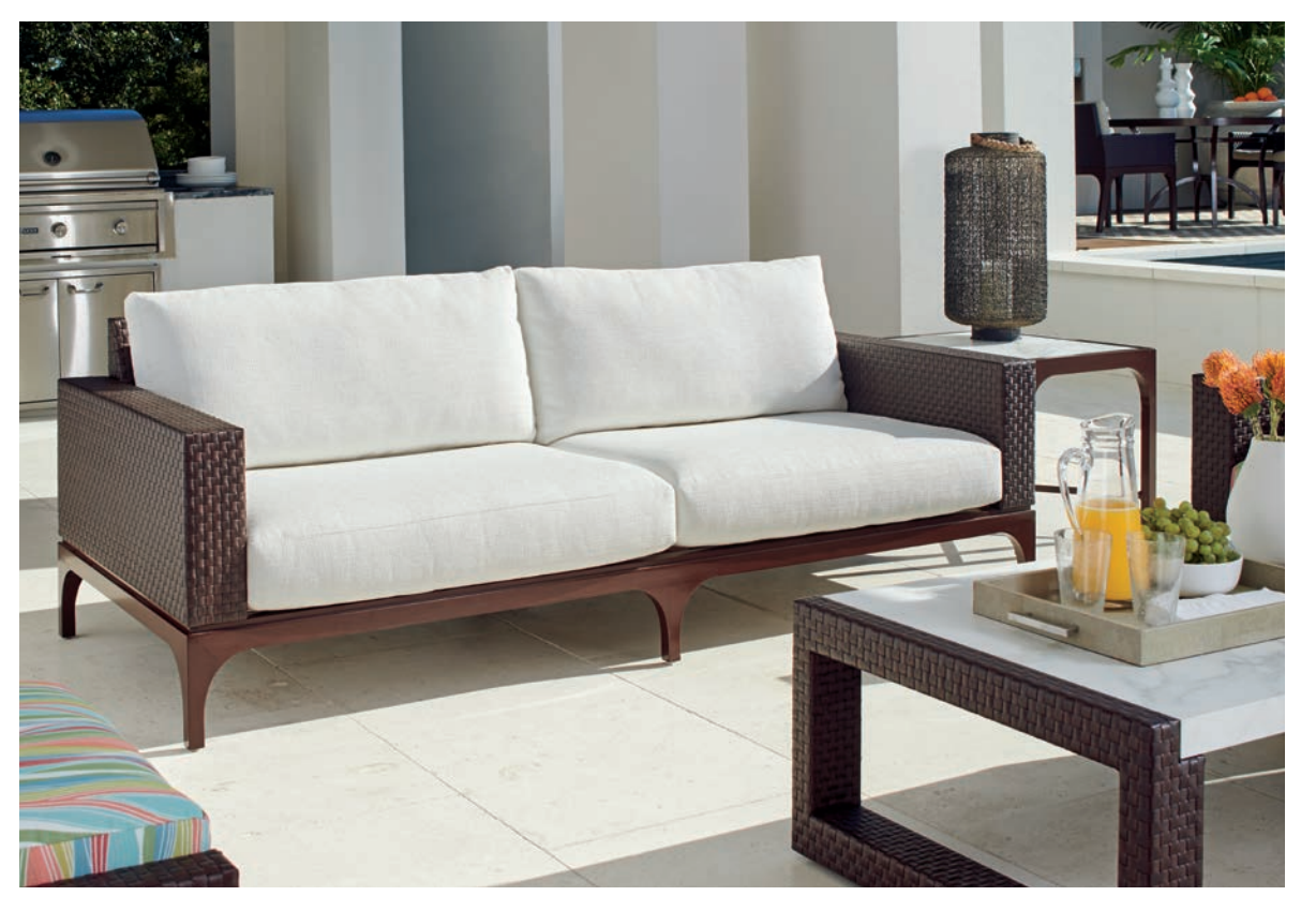
3420-33/CS3420-33 Abaco Sofa and Cushion Set 88W x 37.5D x 34H in.