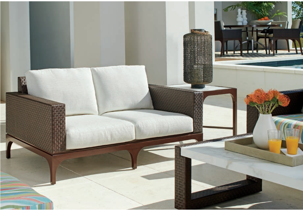
3420-22/CS3420-22 Abaco Love Seat and Cushion Set 62W x 37.5D x 34H in.

Featured on the opposite page are the Abaco 88-inch sofa and 62-inch love seat. Accent pillows on both frames are optional, allowing for unlimited customization as shown below. The 52-inch rectangular cocktail table is one of our favorite designs because of the way it blends woven wicker with a thick sintered stone top. The contrast of materials and colors makes for a striking presentation.