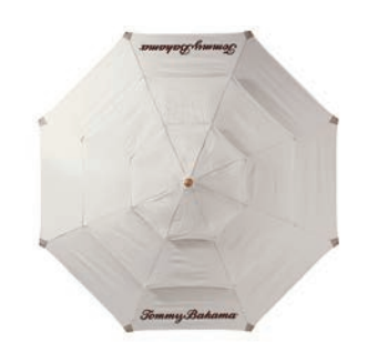
3100-610 Tommy Bahama Signature Umbrella 11 ft. diameter x 8 ft. 9 in. H Pole type and color: 2 inch, one piece wooden pole Fabric number and color: 7404-15, canvas; dark brown logo Umbrella canopy is 11-feet diameter and double wind vented. Canopy has two silk screened Tommy Bahama logos (shown above) and one color ink as noted.

3100-203TB Alfresco Living Metal Table Base 20.5W x 20.5D x 18H in.