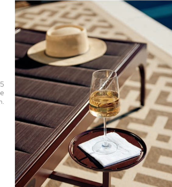
3420-75 Abaco Chaise Lounge 28W x 78D x 40H in.