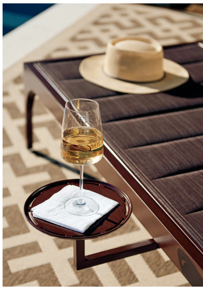
Durable aluminum is hand-finished to replicate the color and grain patterns of English walnut.

Custom sintered stone tops with soft gray veining duplicate the classic look of Carrera marble.