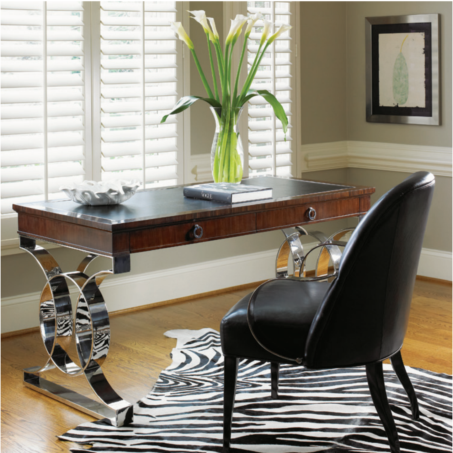
100RW-403 Rosewood Writing Desk 58W x 28D x 30H in.

The Lumina console has a graceful bow front and louvered design motif. It is offered in your choice of the Umber Cherry or Antique Pewter finish, and is available in both 58-inch and 84-inch lengths. The 58-inch design has two louvered doors and the 84-inch design has four doors. Behind each door is an adjustable shelf and it has a five outlet surge protector. These consoles come standard with the infrared SmartEye® system and will accommodate the optional Sligh StrongArm® and/or SmartFan®.