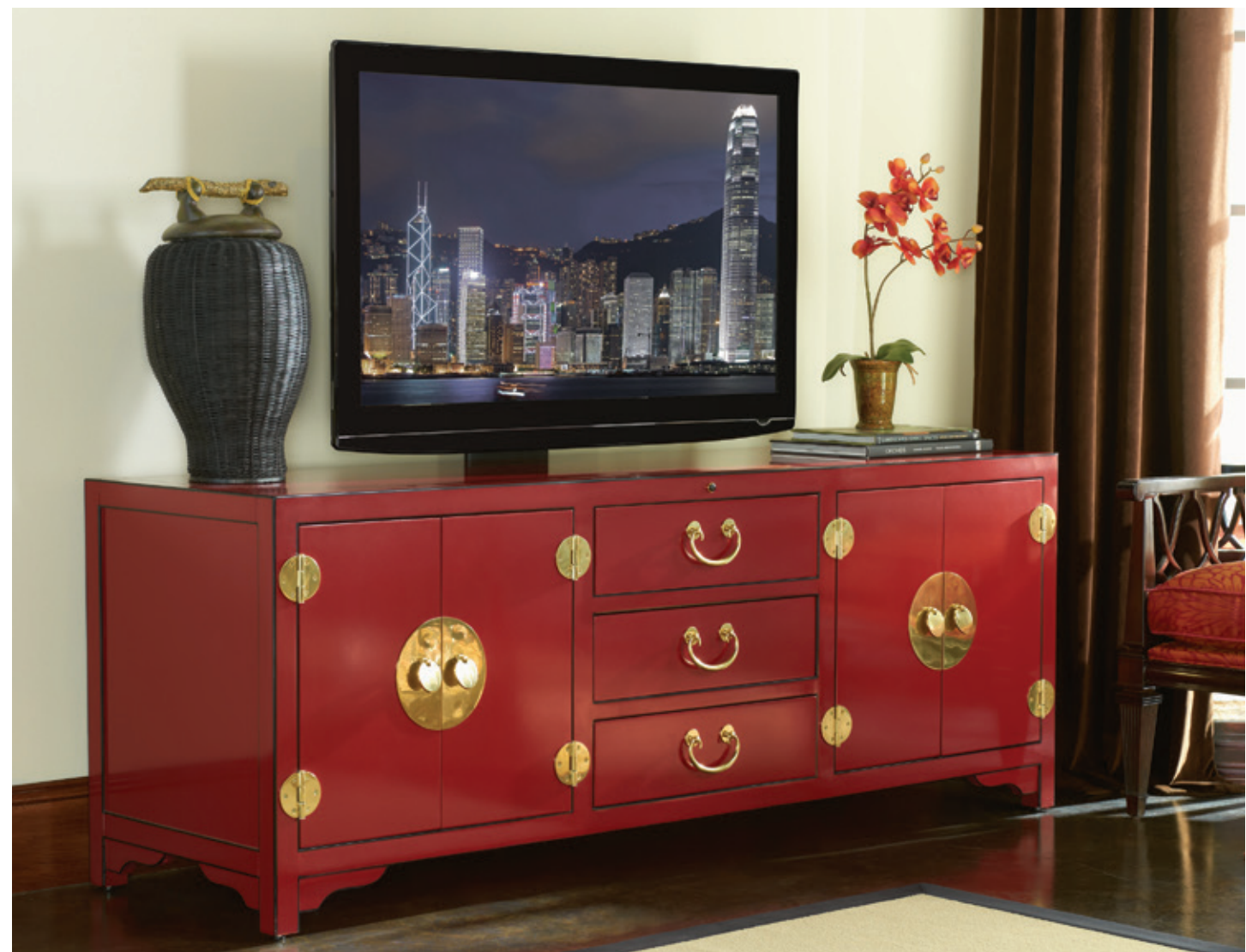
I00SR-660 Pacific Isle Media Console 75W x 22.5D x 28H in.