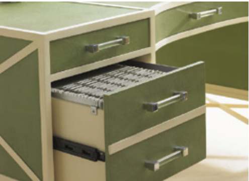
100SM-400 Sea Mist Writing Desk 64.5W x 30D x 30H in.

The Sea Mist desk is elegantly clad in embossed faux Shagreen leather. The frame and decorative cross moldings are finished in a soft ivory coloration. There is one extension file drawer and five storage drawers. Custom pulls are acrylic and chrome.