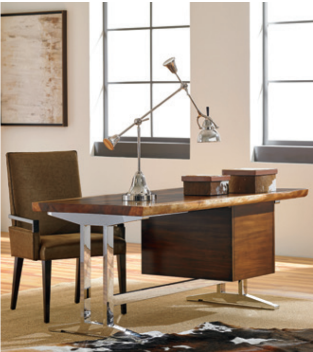
100NL-405 LaCosta Live Edge Writing Desk 68W x 36D x 30H in.

The LaCosta writing desk features a polished stainless base, Mahogany drawer unit and solid Trembesi live-edge top. The Trembesi tree, indigenous to islands in the South Pacific, has the look and characteristics of Black Walnut. Its natural live-edge offers a striking juxtaposition to the contemporary stainless base, giving the piece a unique designer look. The size and shape of natural tops will vary. The drawer box includes two full extension drawers, with the lower drawer accommodating legal or letter files.