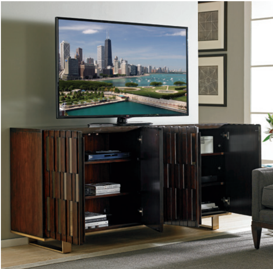
SHOWN RIGHT: 100MT-668 Mystique Media Console 78W x 18D x 36H in.

Crafted from Quartered Zebrano, the Mystique media console is framed with decorative nailhead trim. There are three open compartments at the top, with the middle compartment being wide enough to accommodate a sound bar up to 73-inches. Behind the center doors are two adjustable shelves. Behind each of the outside doors are two additional adjustable shelves. This unit will accommodate the optional Sligh StrongArm® and/or SmartFan®.