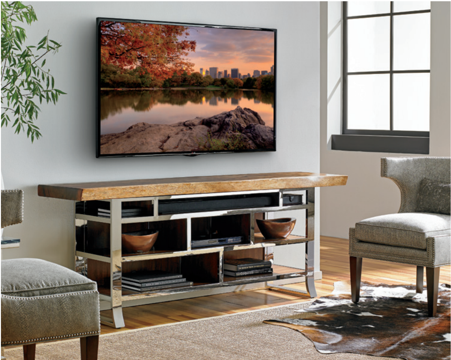
100NL-670 Katara Live Edge Media Console 78W x 18.5D x 30H in.

The Katara media console features a polished stainless base, inset Walnut shelves in eight separate compartments and a solid Trembesi live-edge top. The Trembesi tree, indigenous to islands in the South Pacific, has the look and characteristics of Black Walnut. Its natural live-edge offers a striking juxtaposition to the contemporary stainless base, giving the piece a unique designer look. The size and shape of natural tops will vary.