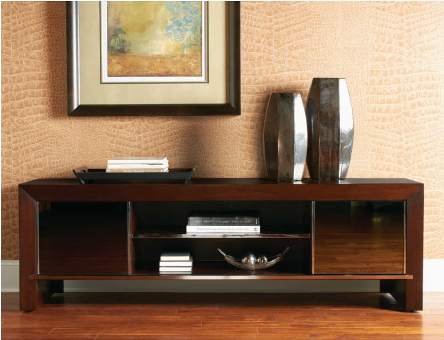
100SK-664 Meridian Media Console 76.25W x 18.5D x 24H in.

The Meridian console features two sliding smoked mirrored doors framed in polished stainless steel. There is one adjustable shelf behind each door and an adjustable shelf in the middle section. This unit will accommodate the optional Sligh StrongArm® and/or SmartFan®.