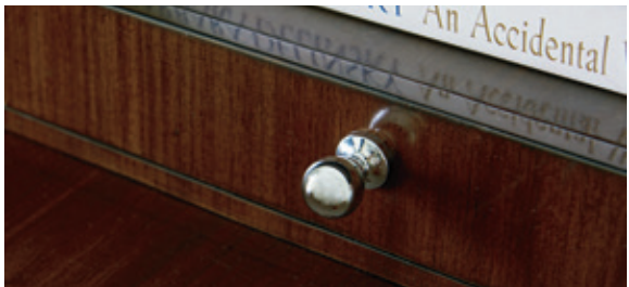
100WW-406 Andrea Writing Desk 62.25W x 28D x 35.5H in.

With a polished stainless base and Quartered Walnut top and gallery, the Andrea writing desk offers a great design statement for the home office. The top shelf above the gallery is half-inch clear glass with a polished edge. There are three drawers in the desk top, and the gallery features three drawers and three open compartments.