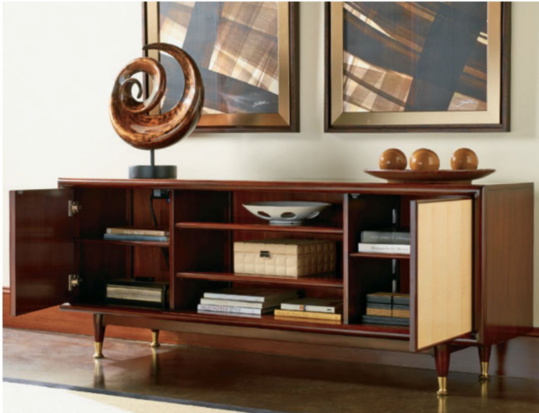
100ML-663 Caprice Media Console 72W x 18D x 28H in.

The Caprice console is crafted in Quartered Walnut, with Figured Syeamore on the doors and brass ferrules on the feet. There are two adjustable shelves in the center section and one adjustable shelf behind each of the doors. This unit will accommodate the optional Sligh StrongArm® and/or SmartFan®.