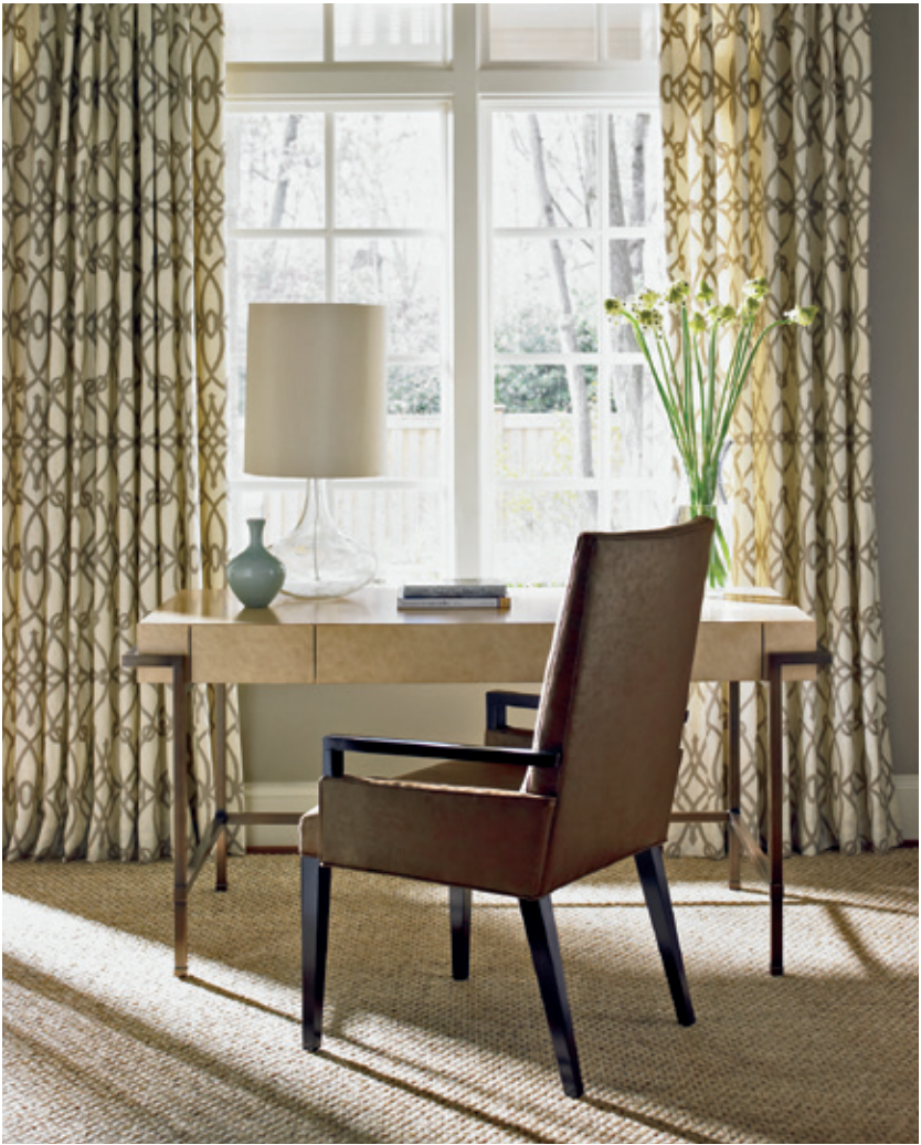
100PR-402 Parchment Writing Desk 60.25W x 30.25D x 30H in.

The Parchment writing desk features a brushed brass architectural base and three functional drawers.