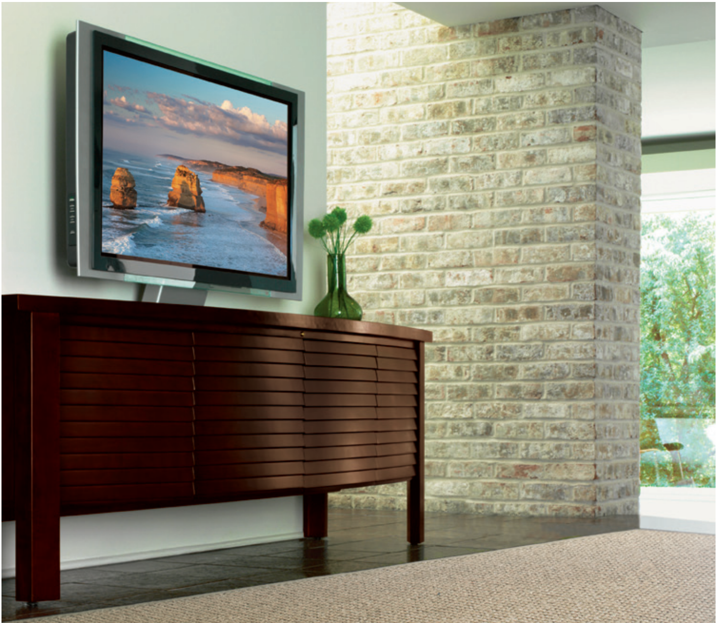
9726-I-UM Lumina Media Console 84.5W x 24D x 28H in.