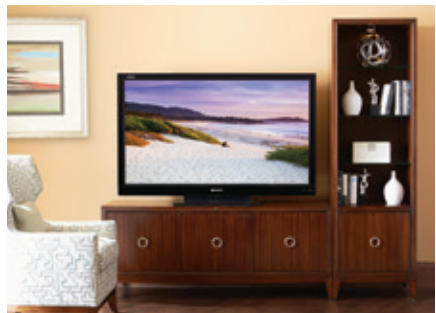
100RS-645 Bolton Pier Unit 23.5W x 19D x 78H in.