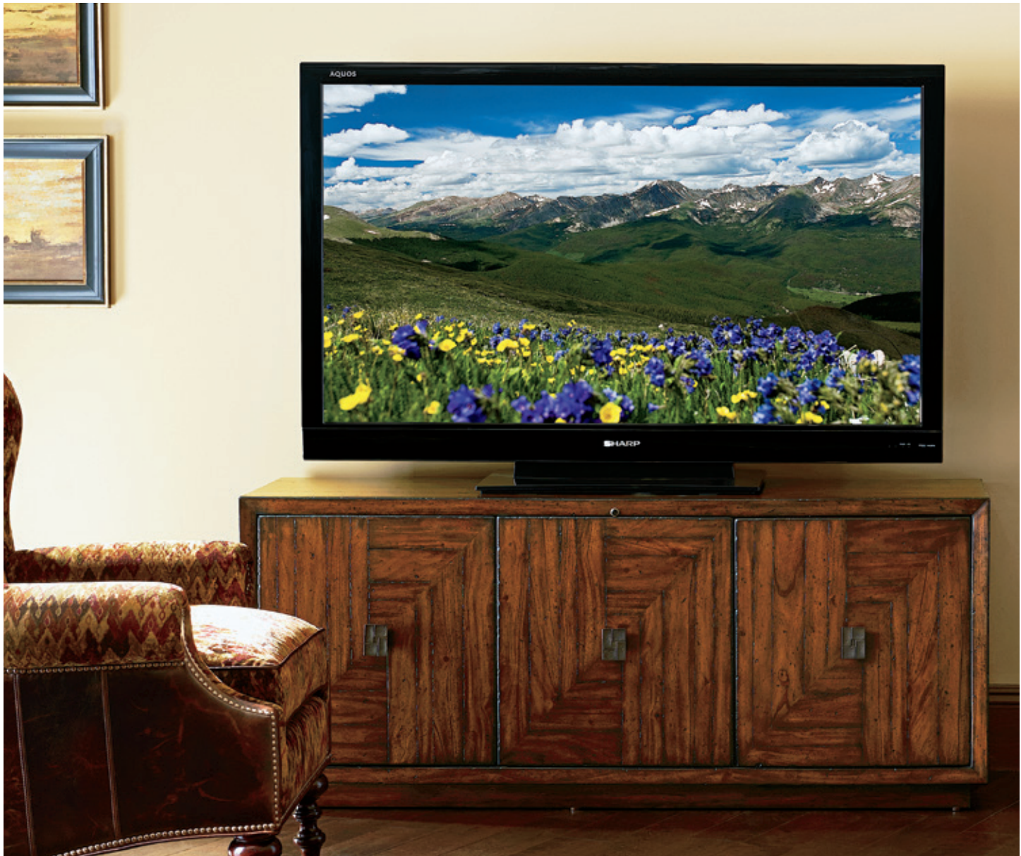
100NL-665 Summerton Media Console 64.25W x 18D x 27H in.

Crafted in Ribbon Stripe Mahogany with custom hardware in a polished nickel finish, the Bolton series offers design flexibility in configuring your home entertainment space. The pier unit has three adjustable glass shelves in the upper compartment with touch lighting at the top, and a stationary shelf behind the door at the bottom. The media console has two adjustable shelves behind each of the three doors, an infrared SmartEye® unit for controlling media components when the doors are closed and a 5-outlet surge protector. This unit will accommodate the optional Sligh StrongArm® and/or SmartFan®.