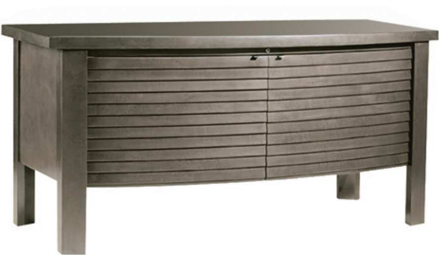
SHOWN LEFT: 9727-I-AP Lumina Media Console 58W x 24D x 28H in.

The Lumina console has a graceful bow front and louvered design motif. It is offered in your choice of the Umber Cherry or Antique Pewter finish, and is available in both 58-inch and 84-inch lengths. The 58-inch design has two louvered doors and the 84-inch design has four doors. Behind each door is an adjustable shelf and it has a five outlet surge protector. These consoles come standard with the infrared SmartEye® system and will accommodate the optional Sligh StrongArm® and/or SmartFan®.