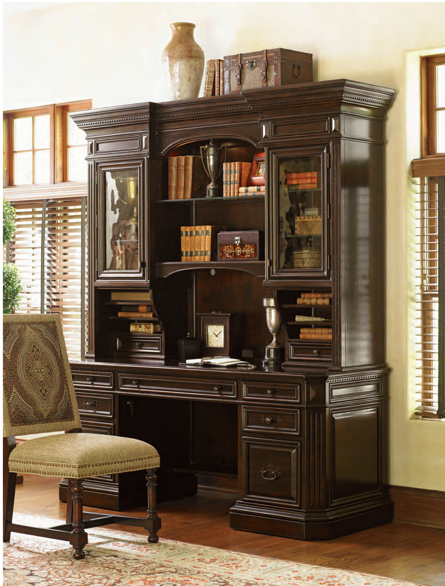
248WN-440 REGENT STREET DECK 75W x 18.25D x 55H in.