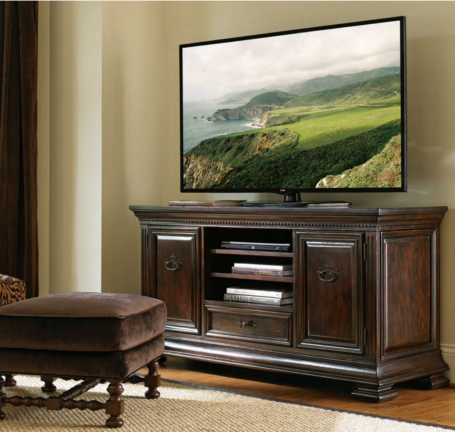
248WN-660 ASHBOURNE MEDIA CONSOLE 61W x 22.5D x 32H in.