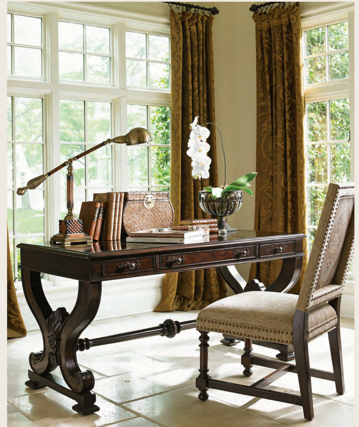
248WN-410 CALLINGTON WRITING DESK 58W x 30D x 29.5H in.

The refined styling of the Callington writing desk is highlighted by acanthus leaf carvings connecting serpentine legs, a hand-carved stretcher, and an elegant three-section writing surface in a custom tortoise shell finish.