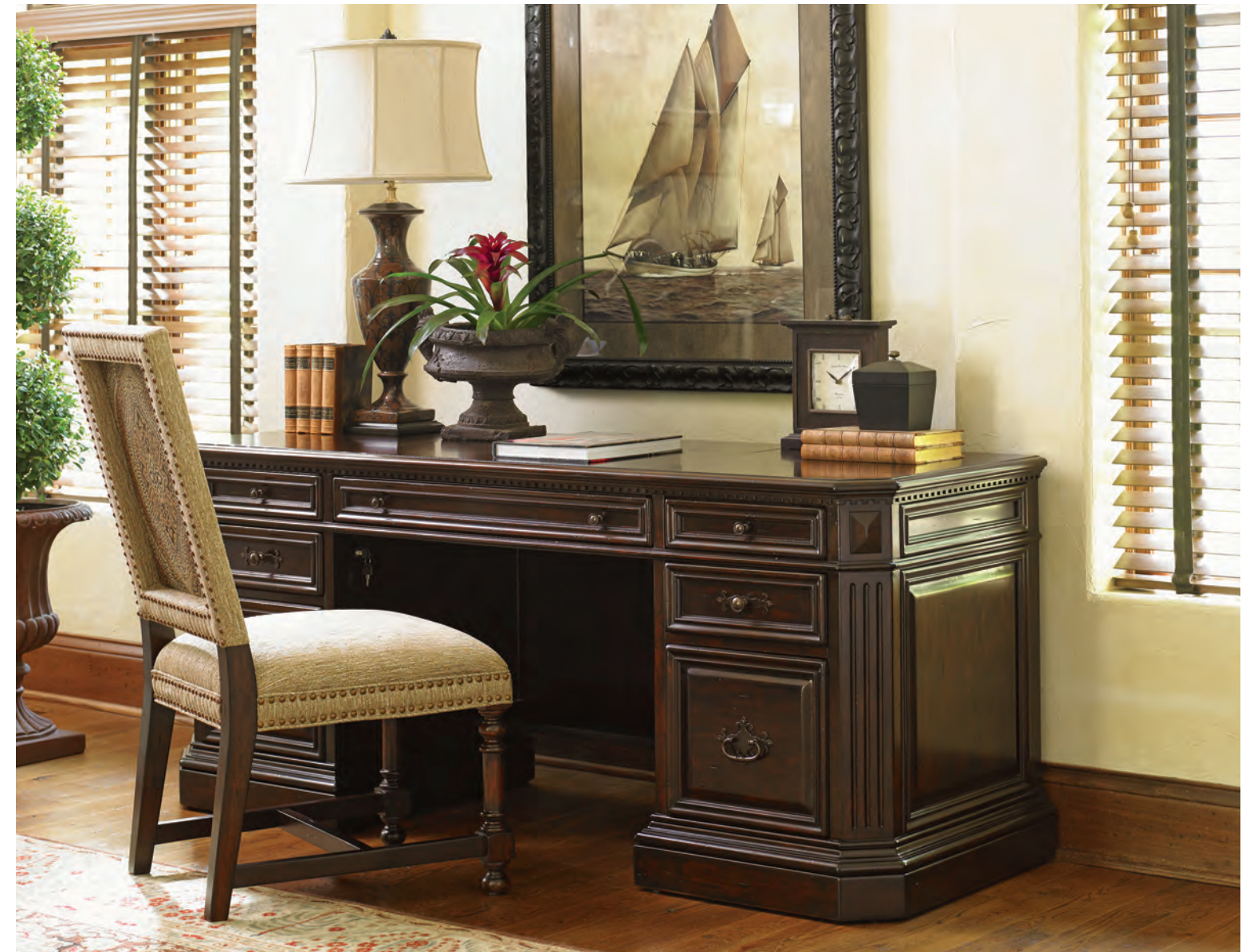
552-880 CAPE VERDE UPHOLSTERED SIDE CHAIR 20.25W x 27.5D x 41.5H in.