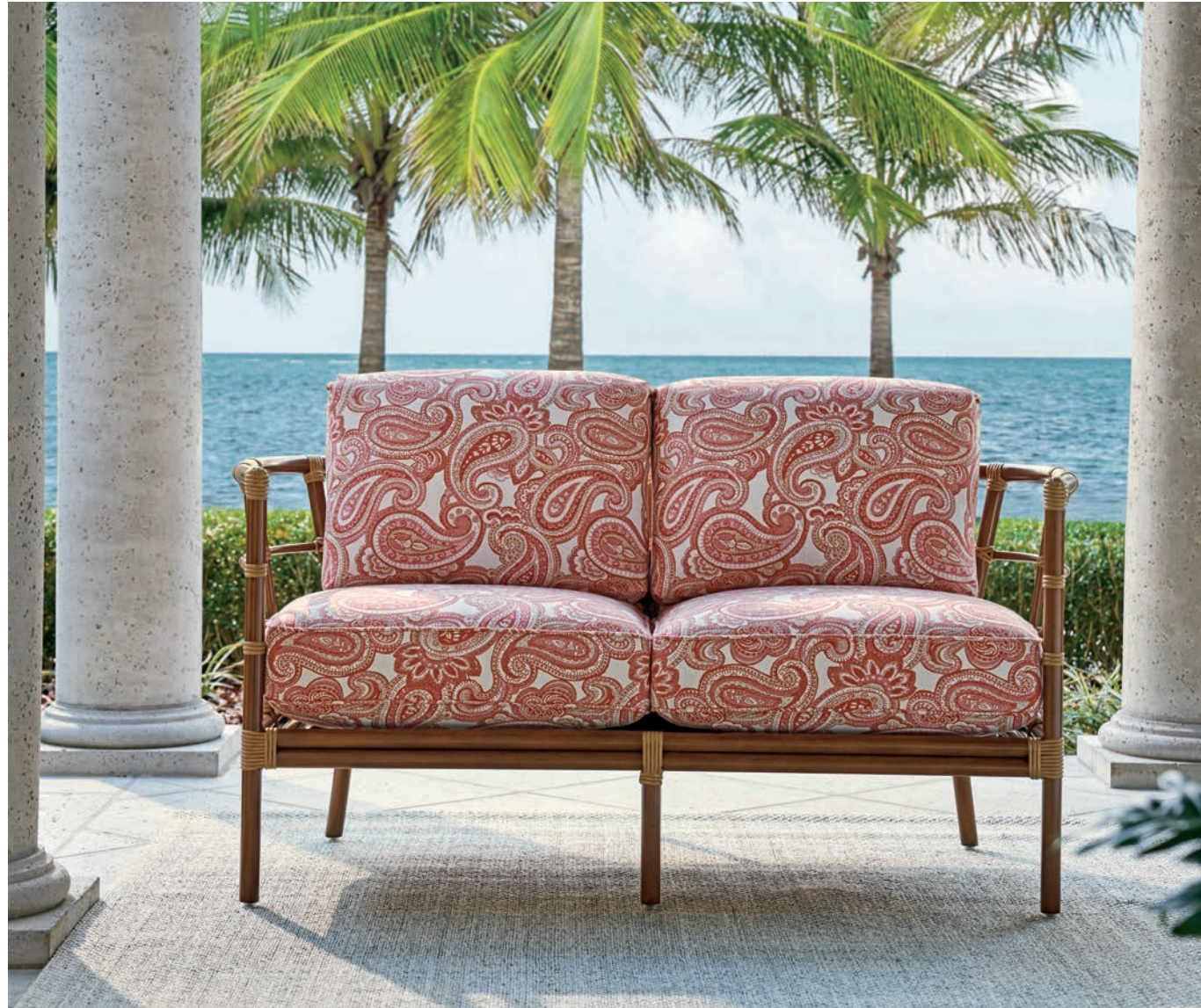
3360-22/CS3360-22 Sandpiper Bay Love Seat and Cushion Set 57.5W x 32D x 34.5H in.

For smaller seating areas or use in pairs, the 58-inch love seat is an excellent choice. The 82-inch companion sofa is shown on page 7. On the opposite page, the wing chair and 19-inch diameter accent table make a perfect pairing. Note the extra plush seat cushion, which offers remarkable comfort.