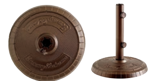
3100-35CUB Tommy Bahama Cast Aluminum Umbrella Base 18 diameter x 21H in.