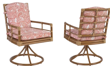
3360-13SR/CS3360-13SR Sandpiper Bay Swivel Rocker Dining Arm Chair and Cushion Set 23.5W x 28D x 36H in. Arm: 23.5H in. Seat: 18.5H in. Inside: 20.5W x 18.5D in. Shown in 7736-51 Gr. D with Welt 7731-51 Gr. D Shown on pages 20, 21 and 22