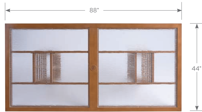
3360-876GT Sandpiper Bay Rectangular Dining Table Glass Top 88W x 44D in.