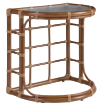
3360-950 Sandpiper Bay Demilune End Table 23W x 18D x 23H in. Shown on pages 14 and 15