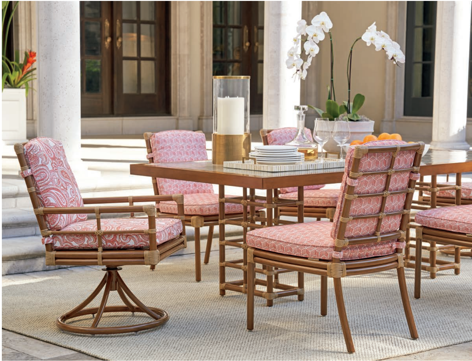
3360-13SR/CS3360-13SR Sandpiper Bay Swivel Rocker Dining Arm Chair and Cushion Set 23.5W x 28D x 36H in. 3360-12/CS3360-12 Sandpiper Bay Dining Side Chair and Cushion Set 21W x 28D x 36H in.

The Sandpiper Bay collection offers 3 dining chair options – a stationary arm and side chair as well as a swivel arm chair. Removable cushions are attached with Velcro straps that match the fabric on the cushions.