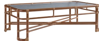
3360-947 Sandpiper Bay Rectangular Cocktail Table 52W x 30D x 16H in. Shown on Front Cover and pages 6, 7 and 8