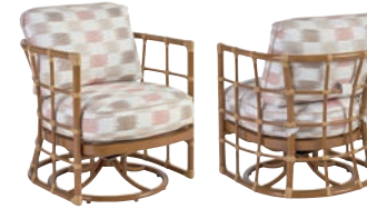
3360-09SW/CS3360-09SW Sandpiper Bay Swivel Chair and Cushion Set 27W x 32D x 35H in. Arm: 27H in. Seat: 18.5H in. Inside: 23.5W x 20D in. Shown in 7734-51 Gr. E with Cord 513-12 Shown on pages 14 and 15