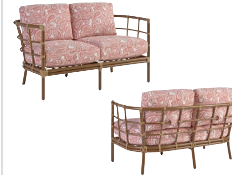
3360-22/CS3360-22 Sandpiper Bay Love Seat and Cushion Set 57.5W x 32D x 34.5H in. Arm: 28.5H in. Seat: 18H in. Inside: 49W x 20.5D in. Shown in 7736-51 Gr. D Shown on page 10