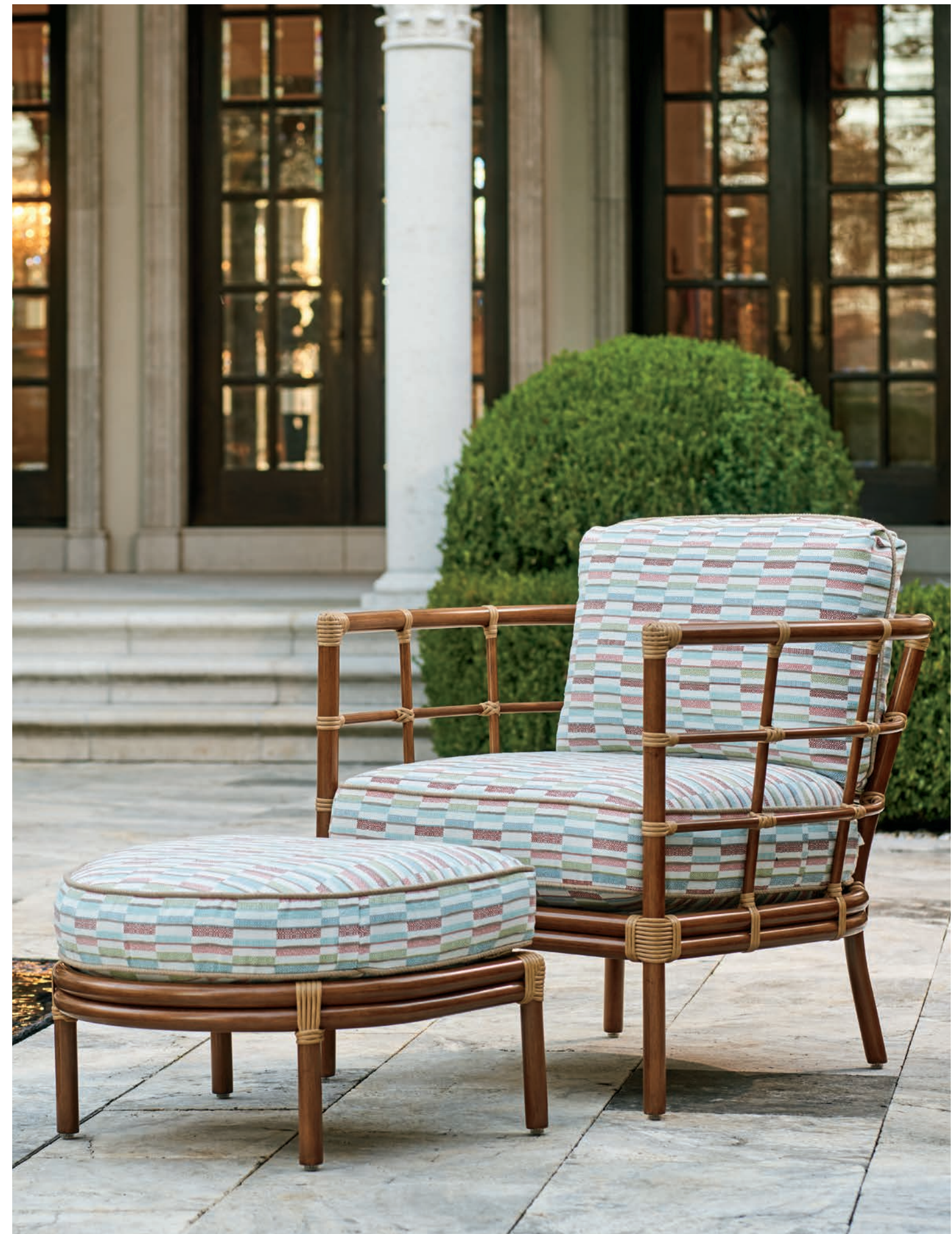
3360-44/CS3360-44 Sandpiper Bay Ottoman and Cushion 25.5W x 20D x 16.5H in.