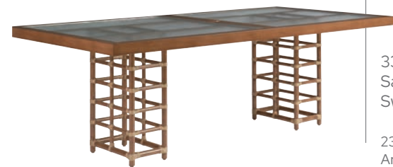
3360-876GT Sandpiper Bay Rectangular Dining Table Glass Top 88W x 44D x 2.25H in.