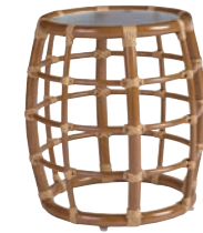
3360-952 Sandpiper Bay Round Accent Table 19 diameter x 20H in. Shown on Front Cover and pages 6 and 11