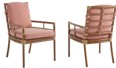
3360-13/CS3360-13 Sandpiper Bay Dining Arm Chair and Cushion Set 23.5W x 28D x 36H in. Arm: 23.5H in. Seat: 18.5H in. Inside: 20.5W x 18.5D in. Shown in 7731-51 Gr. D Shown on pages 2, 23, 24 and 25