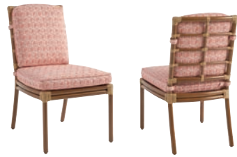
3360-12/CS3360-12 Sandpiper Bay Dining Side Chair and Cushion Set 21W x 28D x 36H in. Seat: 18.5H in. Inside: 21W x 18.5D in. Shown in 7724-51 Gr. E Shown on pages 20, 21 and 22