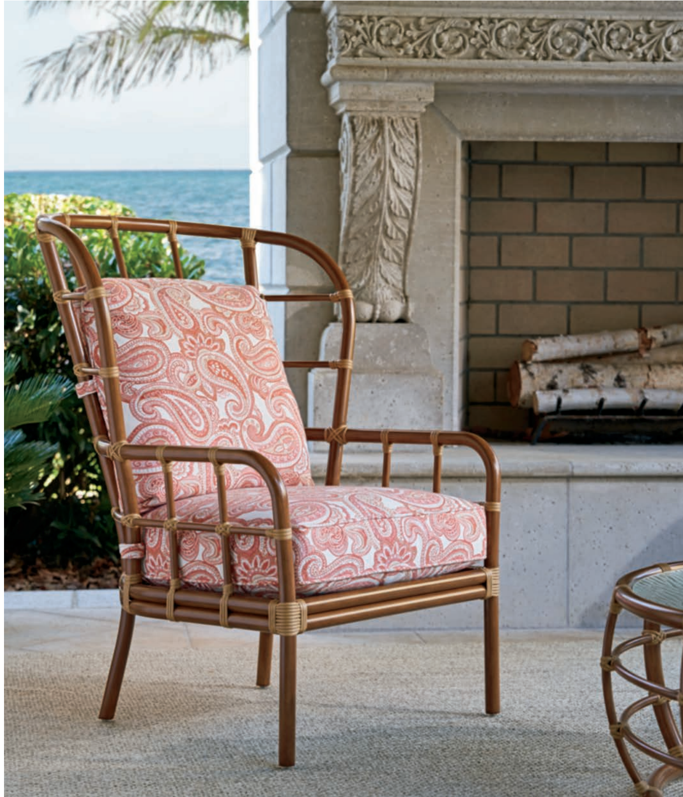
3360-10 /CS3360-10 Sandpiper Bay Wing Chair and Cushion Set 32W x 35D x 43H in.

On the opposite page, the generous 42-inch diameter cocktail table serves as the perfect center point for an outdoor setting, accommodating seating on two or three sides. The large surface area serves as a beautiful showcase for the wavy glass top.