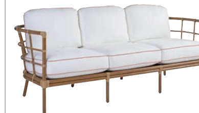
3360-33/CS3360-33 Sandpiper Bay Sofa and Cushion Set 82W x 32D x 34.5H in. Arm: 28.5H in. Seat: 18H in. Inside: 74.5W x 20.5D in. Shown in 7323-11 Gr. B with Welt 7721-51 Gr. C, additional two 22" Throw Pillows in 7733-51 Gr. G with Key Tassel 404-51 (weltless), additional two 20" Throw Pillows one side in 7735-51 Gr. E/one side in 7721-51 Gr. C (weltless), additional one 24 x 12" Kidney Pillow in 7731-51 Gr. D (weltless) Shown on Front Cover and pages 7 and 8