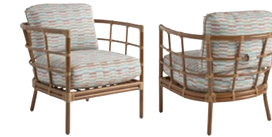
3360-11/CS3360-11 Sandpiper Bay Lounge Chair and Cushion Set 32W x 32D x 34.5H in. Arm: 28.5H in. Seat: 18H in. Inside: 24.5W x 20.5D in. Shown in 7738-61 Gr. F with Cord 513-13 Shown on pages 17 and 18