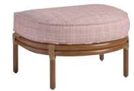
3360-44/CS3360-44 Sandpiper Bay Ottoman and Cushion 25.5W x 20D x 16.5H in. Seat: 14.5H in. Shown in 7732-51 Gr. D Shown on page 16 Shown in 7738-61 Gr. F with Cord 513-13 Shown on page 17