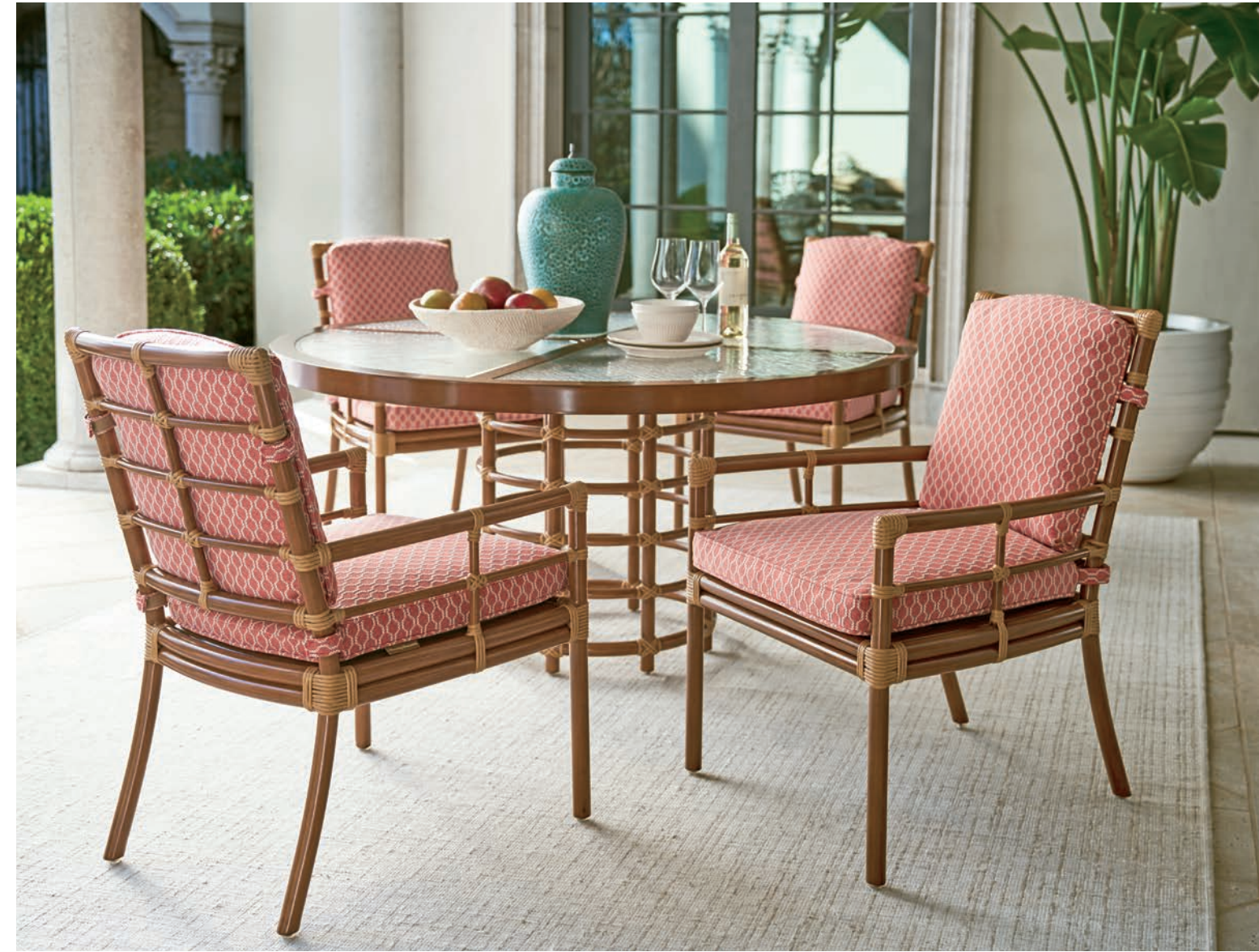
3360-13/CS3360-13 Sandpiper Bay Dining Arm Chair and Cushion Set 23.5W x 28D x 36H in.