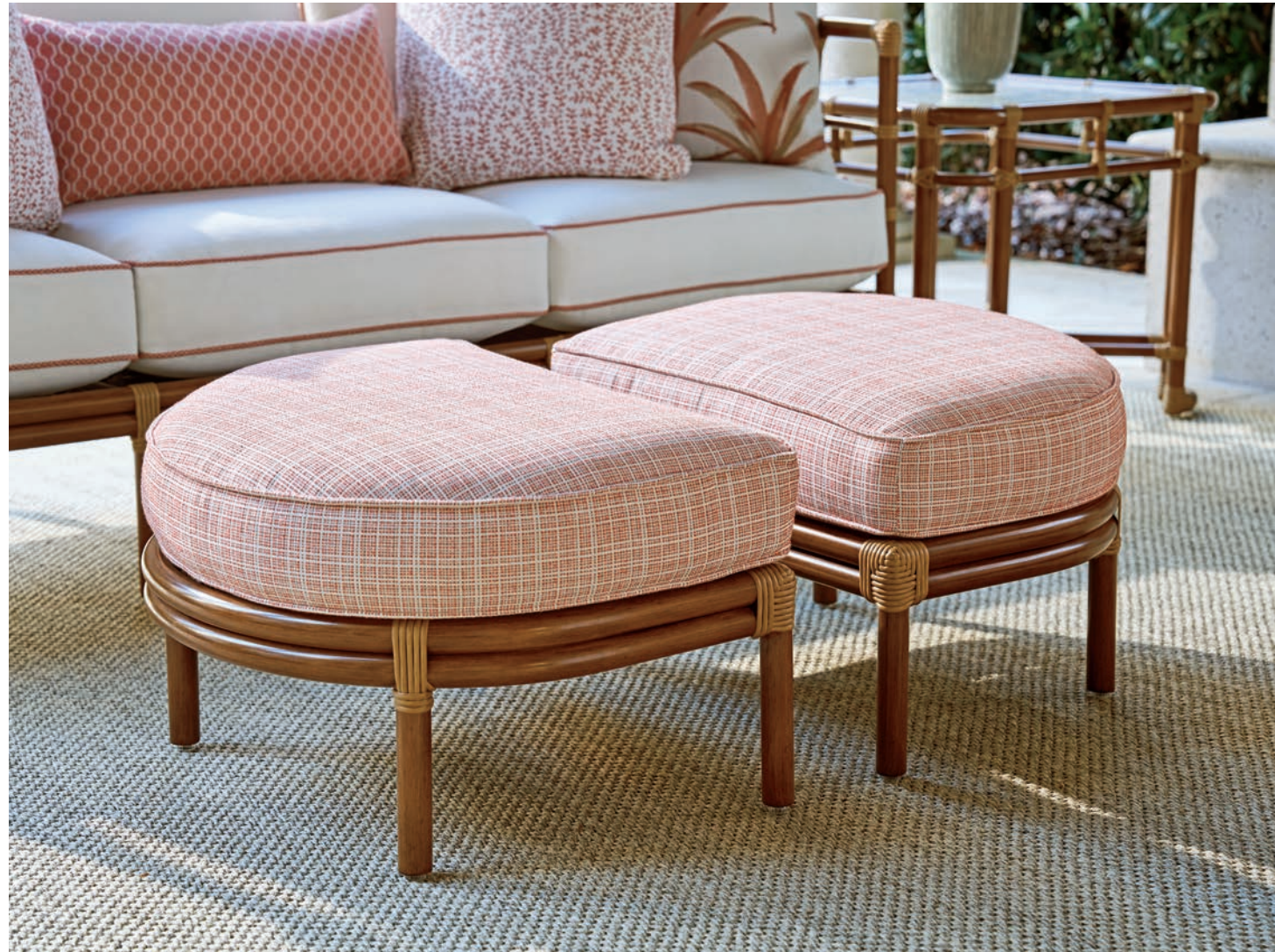
3360-44/CS3360-44 Sandpiper Bay Ottoman and Cushion 25.5W x 20D x 16.5H in.

On the opposite page, the Sandpiper Bay lounge chair is shown with a matching curved ottoman. Shown below, a pair of ottomans are used in a cocktail configuration, providing extra seating. The seat cushion is attached using Velcro straps.