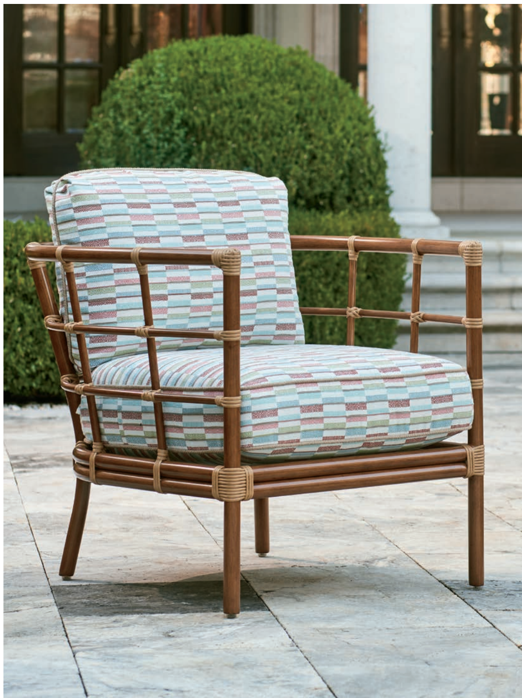
3360-11/CS3360-11 Sandpiper Bay Lounge Chair and Cushion Set 32W x 32D x 34.5H in.

On the opposite page the chaise lounge offers an invitation to relax in style with the look of a leather-wrapped bamboo base, wheels on the back legs for mobility, and a plush seat cushion that is seamed to accommodate the 4 positions of the headrest.