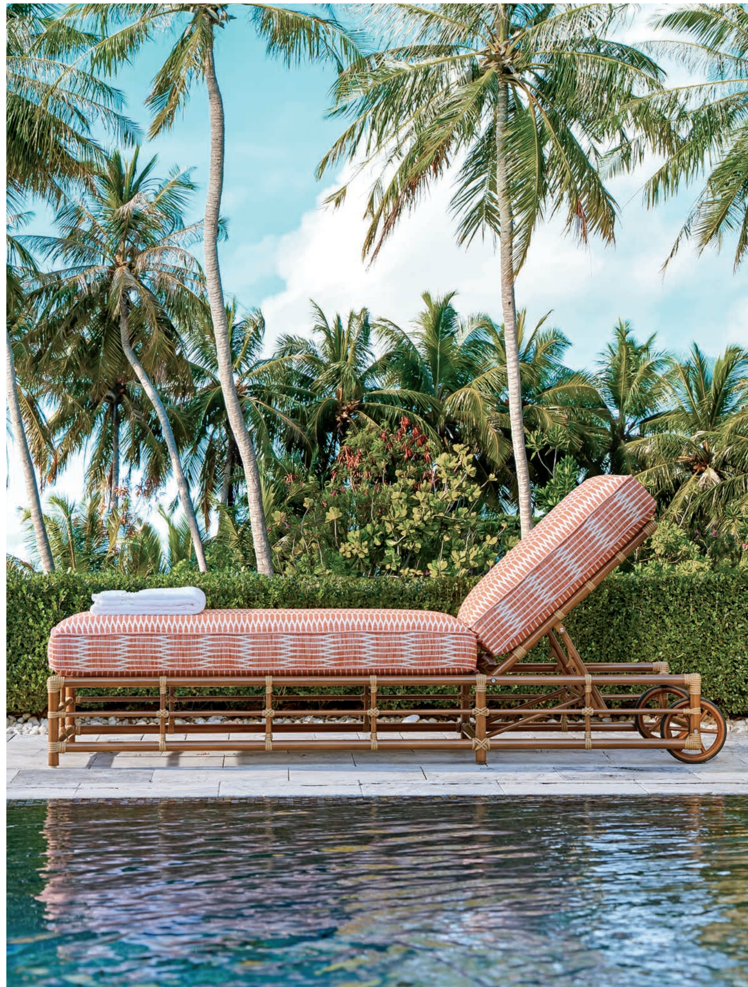
3360-75/CS3360-75 Sandpiper Bay Chaise Lounge and Cushion Set 29.5W x 82D x 39.5H in.