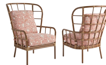
3360-10 /CS3360-10 Sandpiper Bay Wing Chair and Cushion Set 32W x 35D x 43H in. Arm: 24H in. Seat: 18.5H in. Inside: 25.5W x 20D in. Shown in 7736-51 Gr. D Shown on Front Cover and pages 6, 11 and 12