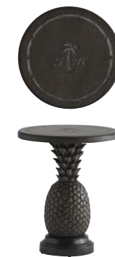
3100-202 Alfresco Living Pineapple Table Base & Top 18.25 diameter x 22H in. Weathered driftwood top on a charcoal gray pedestal