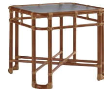
3360-955 Sandpiper Bay Square End Table 26W x 26D x 22.5H in. Shown on Front Cover and pages 7 and 9