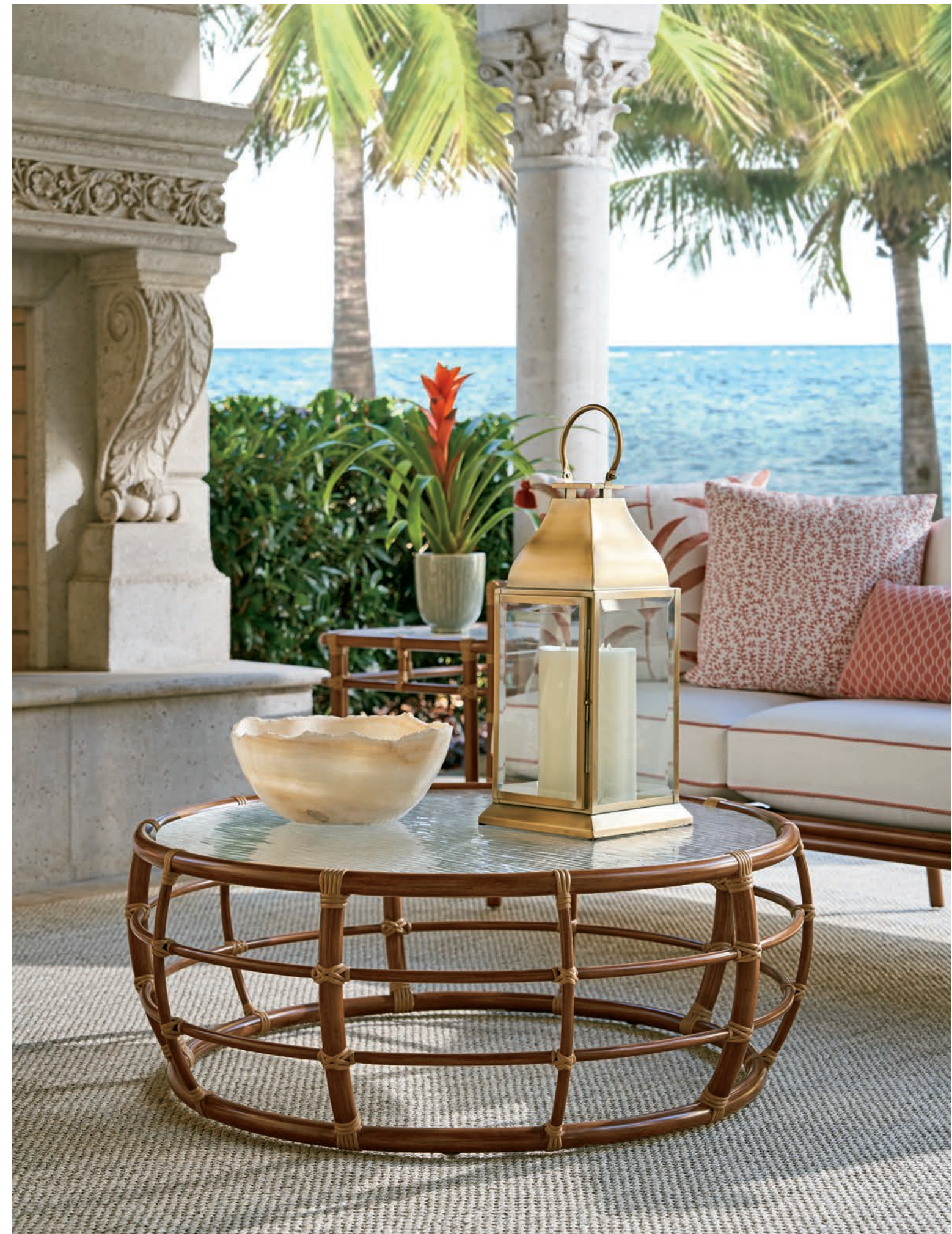
3360-943 Sandpiper Bay Round Cocktail Table 42 diameter x 16H in.