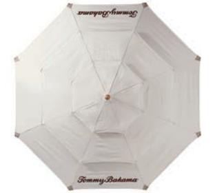
3100-610 Tommy Bahama Signature Umbrella 11 ft. diameter x 8 ft. 9 in. H Pole type and color: 2 inch, one piece wooden pole Fabric number and color: 7404-15, canvas; dark brown logo Umbrella canopy is 11-foot diameter and double wind vented. Canopy has two silk screened Tommy Bahama logos (shown above) and one color ink as noted.