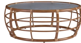
3360-943 Sandpiper Bay Round Cocktail Table 42 diameter x 16H in. Shown on page 13