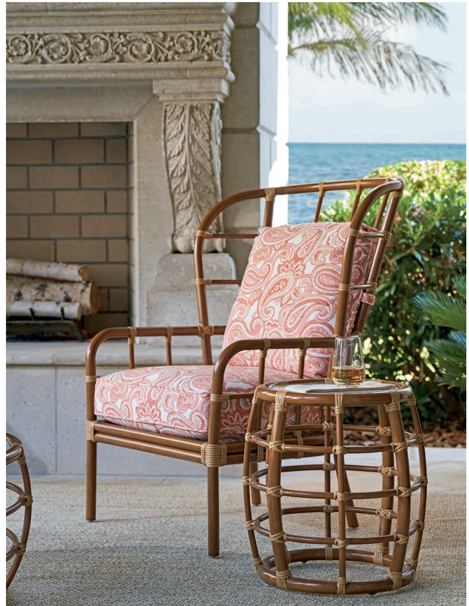
3360-952 Sandpiper Bay Round Accent Table 19 diameter x 20H in.