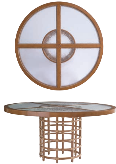
3360-870GT Sandpiper Bay Round Dining Table Glass Top 60 diameter x 2.25H in.