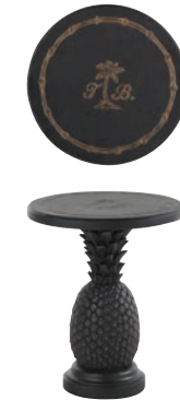
3100-201 Alfresco Living Pineapple Table Base & Top 18.25 diameter x 22H in. Rich Black Coloration with Golden Highlights