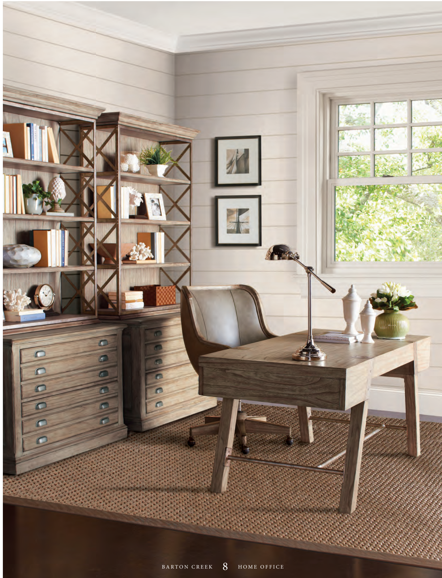
Left: 300BA-410 WYATT DESK 64W x 32D x 30H in.