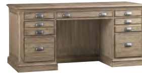
300BA-411 Austin Desk Overall: 66W x 30D x 30H in. Gray leather top; 6 drawers (2 file drawers will accommodate legal/letter size files; drop-front keyboard drawer; 2 adjustable shelves; cord management Shown on pages: 6, 7, 10