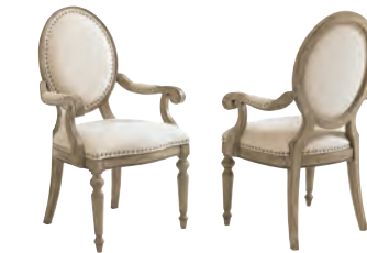
352-883-01 Byerly Arm Chair Overall: 26W x 23.5D x 41.75H in. .4375 in. nailhead trim Seat 22W x 19D x 19.5H in. Arm 26.5H in. Available only in standard fabric 479311 Bridgeport - A basket-weave textured cotton in a soft ivory coloration CHAIR SHIPS TWO PER BOX CHAIR SHIPS ASSEMBLED Shown on page: 9