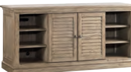
300BA-660 Travis TV Console Overall: 64W x 22D x 30.25H in. 2 swinging louvered doors that open 180° so that ends or center section can be open or closed; 1 drawer; 6 adjustable shelves; 5 outlet surge protector; cord management Shown on pages: 12, back cover