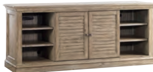
300BA-661 Bullock TV Console Overall: 72W x 22D x 30.25H in. 2 swinging louvered doors that open 180° so that ends or center section can be open or closed; 1 drawer; 6 adjustable shelves; 5 outlet surge protector; cord management Shown on page: 12