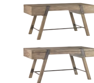
300BA-410 Wyatt Desk Overall: 64W x 32D x 30H in. 3 drawers; metal accents Shown on pages: front cover, 8, 9