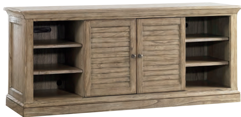
300BA-661 BULLOCK TV CONSOLE 72W x 22D x 30.25H in.

The innovative plantation shutter doors on the Travis and Bullock consoles are two-sided and pivot 180 degrees to conceal either the center or outside compartments. The center compartment features a single media storage drawer and two adjustable shelves.