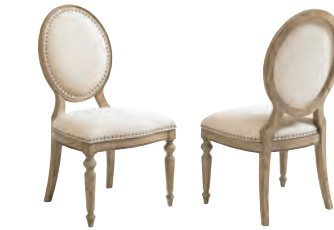
352-882-01 Byerly Side Chair Overall: 21W x 23.5D x 41.75H in. .4375 in. nailhead trim Seat 21W x 19D x 19.5H in. Available only in standard fabric 479311 Bridgeport - A basket-weave textured cotton in a soft ivory coloration CHAIR SHIPS TWO PER BOX ASSEMBLY REQUIRED Shown on pages: 3, 4, 5