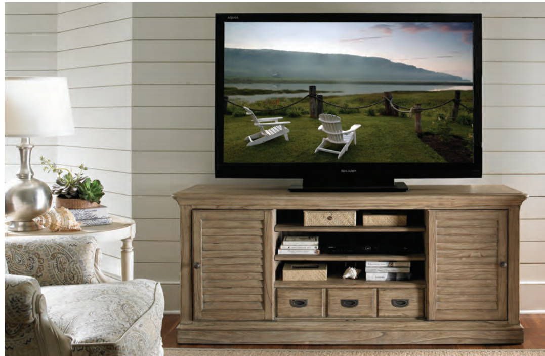
300BA-660 TRAVIS TV CONSOLE 64W x 22D x 30.25H in.