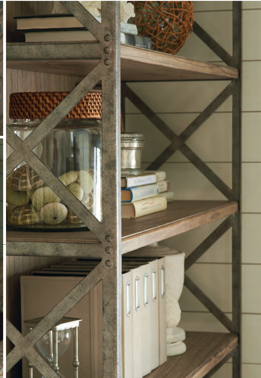
The Johnson file chest is designed to look like a classic 6-drawer map chest. In reality, it features two large file drawers. The optional deck features a vintage industrial style metal frame in an x-pattern with rivets and three fixed shelves for storage.