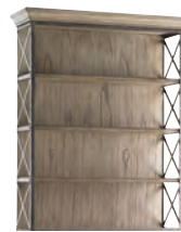
300BA-441 Johnson Deck Overall: 45.25W x 15D x 57.25H in. Metal end panels; 3 stationary shelves Complements 300BA-450 Johnson File Chest Shown on pages: 6, 7, 10, 11