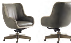
300BA-938-01 Fischer Desk Chair Overall: 29W x 27D x 35-39H in. Arm 26.5H in. Seat 21W x 19D x 20.5-24.5H in. Casters; metal accents Available only in standard leather 150278 Shown on pages: front cover, 8, 9, 10