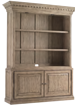
300BA-460 Mt. Bonnell Bookcase Overall: 72W x 20.5D x 91.5H in. Upper section: 2 wood framed glass shelves; touch lighting; cord management Lower section: 2 doors; 2 adjustable shelves; cord management Shown on pages: 4, 5