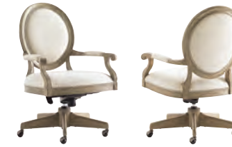
300BA-939-01 Bradshaw Desk Chair Overall: 27W x 29D x 40-44H in. Arm 25.5H in. Seat 20W x 20.5D x 18-22H in. Casters; decorative .375 inch diameter pewter nailhead trim Available only in standard fabric 479311 - A basket-weave textured cotton in a soft ivory coloration Shown on pages: 6, 7