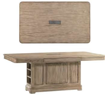
300BA-300 Westlake Dining Table Overall: 78W x 46D x 30H in. 2 doors; 4 drawers; 6 adjustable shelves; media charging station; 4 outlets and 1 powered USB port; circuit breaker and surge protection. Shown on pages: 3, 4, 5