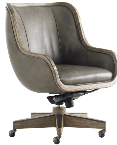
Right: 300BA-450 JOHNSON FILE CHEST 46W x 21.5D x 31H in. 352-883-01 BYERLY ARM CHAIR 26W x 23.5D x 41.75H in.